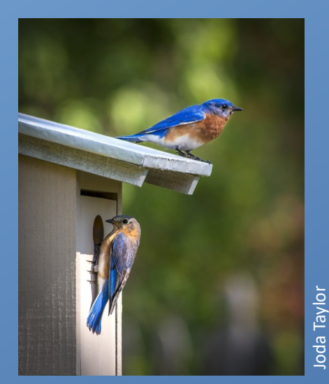
Male (upper) & Female (lower)

Bluebird: Relatively neat nest built with fine grasses and/or pine needles. Usually 1-4 inches tall. Eggs (3-5) are powder blue or occasionally white.